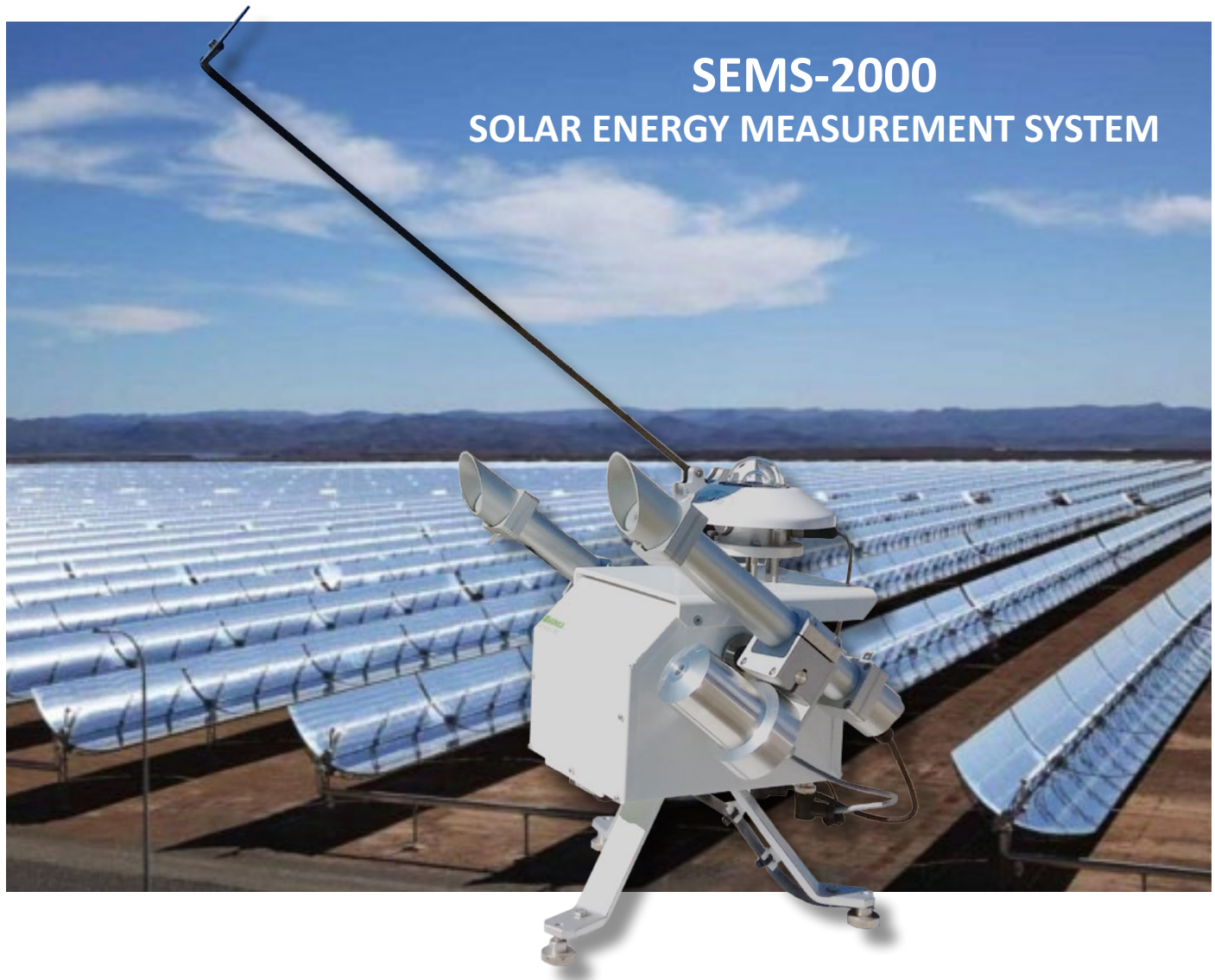
SEMS-2000 SOLAR ENERGY MEASUREMENT SYSTEM

VERY PRECISE AND LIGHTWEIGHT SOLAR TRACKER FOR AUTOMATIC MEASUREMENT OF DIRECT, GLOBAL AND DIFFUSE SOLAR RADIATION