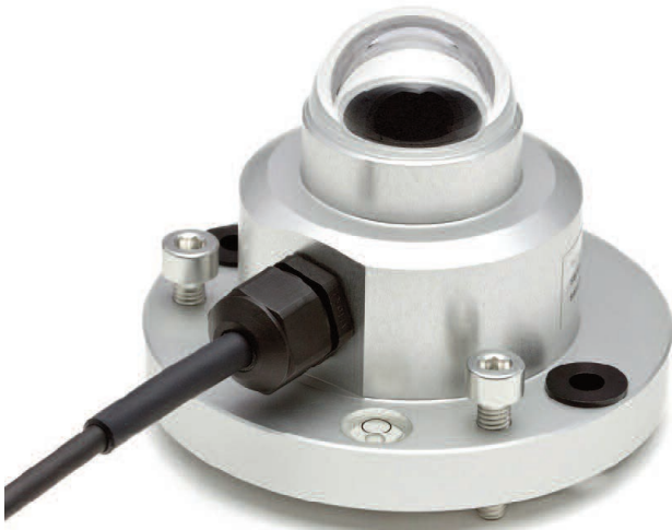
Figure 1 GEO-LP02 Second Class pyranometer