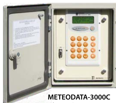
METEODATA-3000C Datalogger/Transmitter Unit (3G/GPRS, radio or satellite)